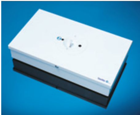
Surface Mount Spitfire