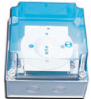
Weatherproof Head Option

Notes: Stanilite 10W Spitfire is ordered complete in one box with the head option of your choice. Add