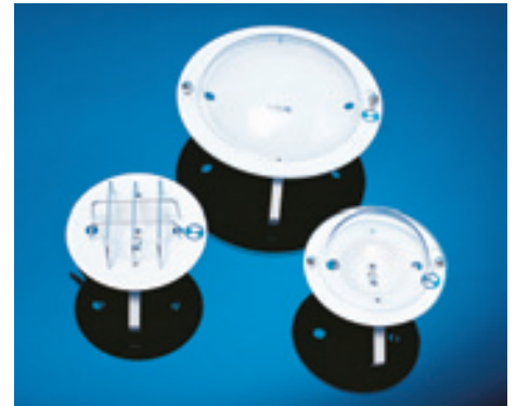
Wireguard & Clear Dome Options