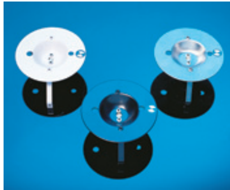
White, Black or Stainless Steel Options