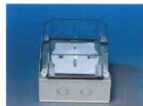
IP65 weatherproof enclosure