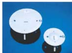
Small and Large Spinnings