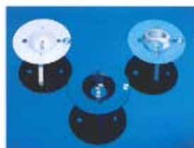
Powder-coated Spinnings. Also available in Stainless Steel. (Will effect photometric performance)