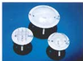
Wireguard or Acrylic Domes available.